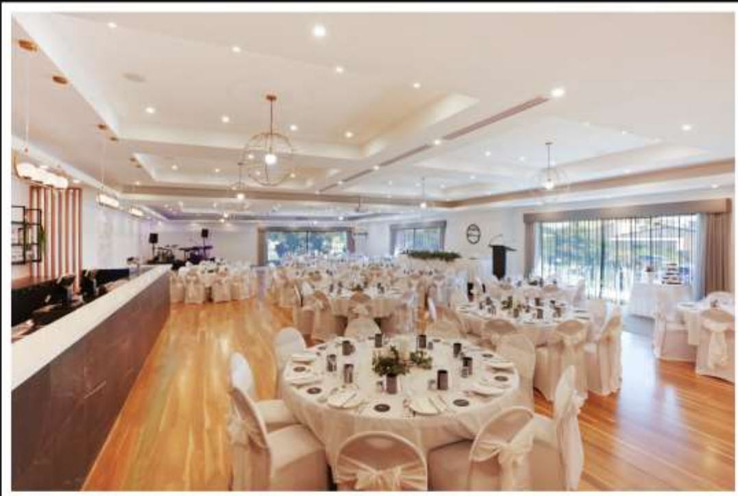
The Carmichael Room